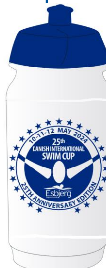
11. Swim Cup drinking bottle