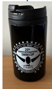
15. Swim Cup thermal cup