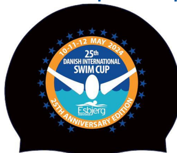
13. Swim Cup swim cap