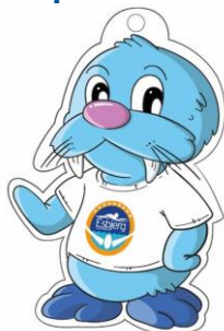
12. Swim Cup mascot keyhanger