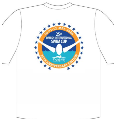
10. Swim Cup t-shirt