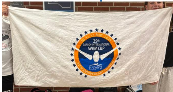
14. Swim Cup towel